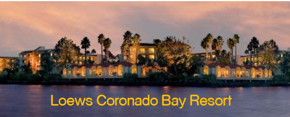
Loews Coronado Bay Resort

Ours is the event of choice for holistic nutrition professionals and students! Nationally acclaimed speakers, amazing organic & sustainably grown foods, and networking opportunities draw holistic practitioners from around the globe .